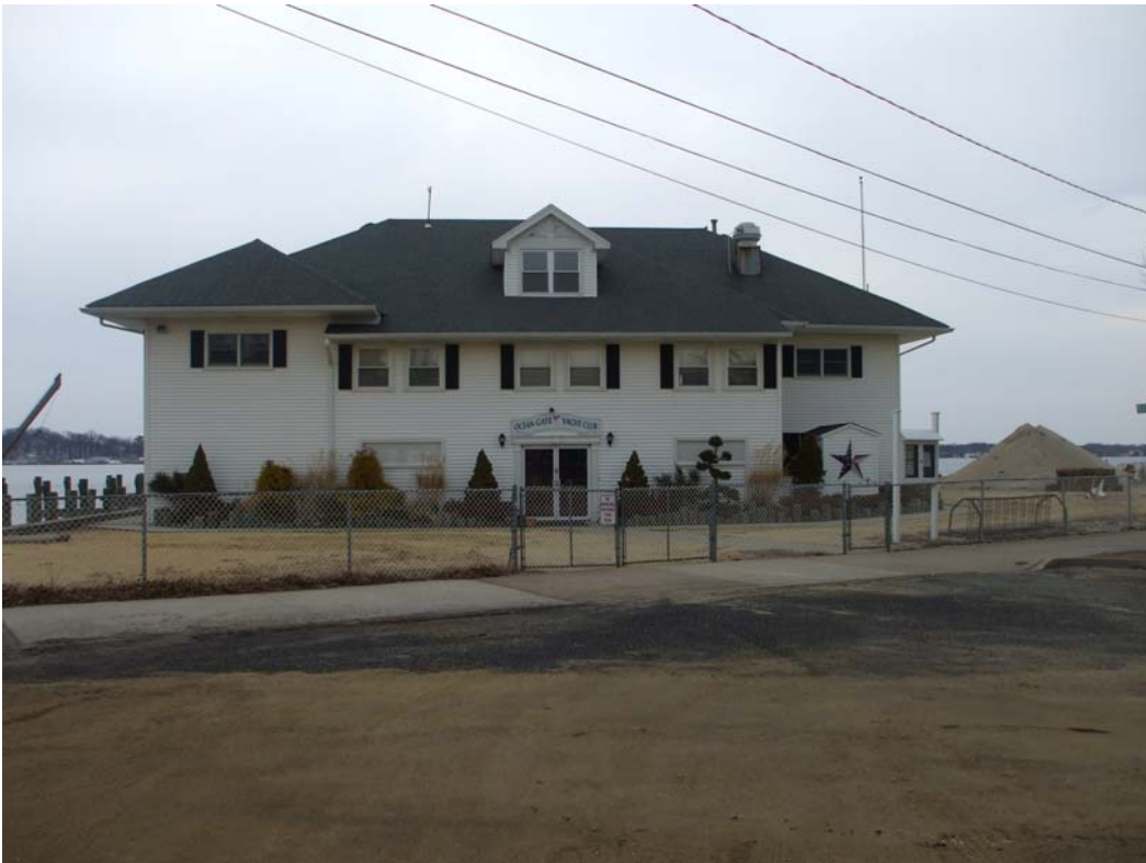
OGYC February 2011