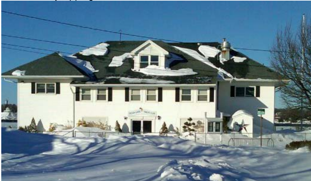
OGYC December 2010